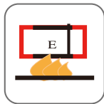
Circuit Integrity IEC 60331-23/BS 6387(Optional)