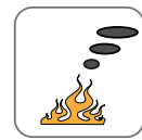
Low Smoke Emission EN 61034-2